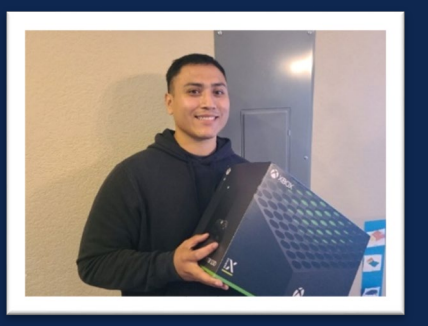
"It was an amazing experience very fun to play with other Sailors in a competitive game! I hope to see more tournaments like this! Thank you for the opportunity of letting us play!" -Spartacus172